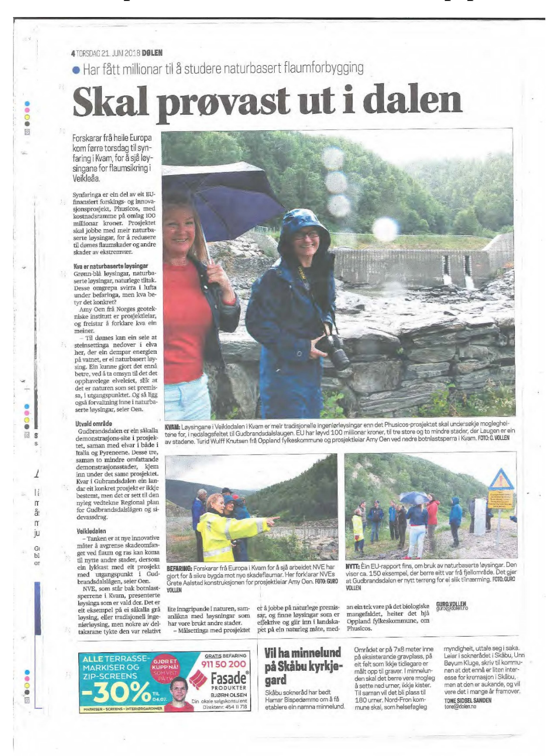
Figure 1: PHUSICOS article published June 21, 2018 in Dølen, the local newspaper for the municipality of Nord-Fron in Oppland, Norway.